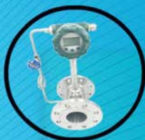
Nextflo Vortex Flowmeter