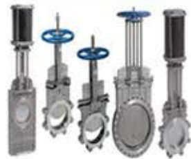
Knife Gate Valve