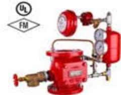
Weflo Alarm Check Valve