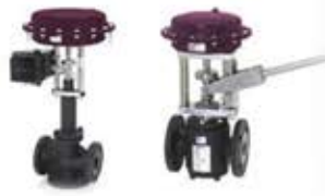
Three Way Control Valve