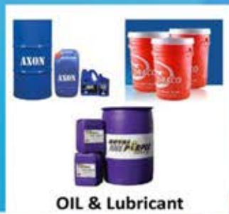
OIL & Lubricant