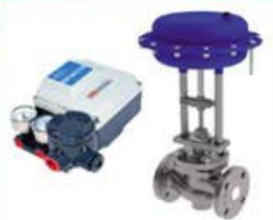
HORA Control Valve