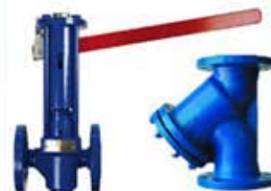
Blowdown PA 46 & Y-Strainer