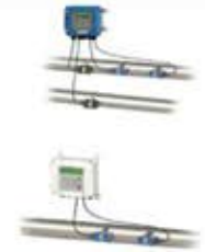
Fixed Ultrasonic Flowmeter