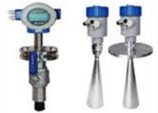
Inserted & Radar Magnetic Flowmeter