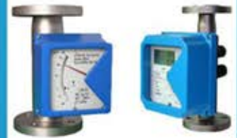
Metal Tube Rotameter