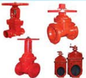
WEFLO Valve Fire System