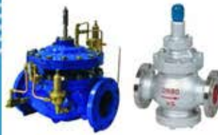
Water & Steam PRV