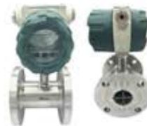
NEXTFLO Liquid Turbine Flowmeter