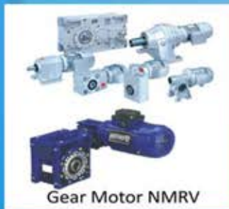
Gear Motor NMRV