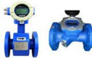
NEXTFLO Ultrasonic Flowmeter